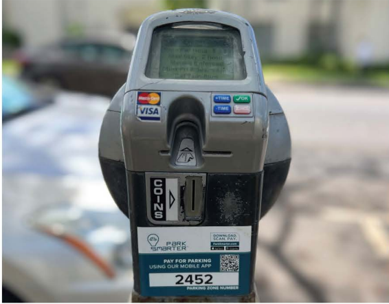
A City Smart Meter with QR code to download Park Smarter Mobile App

Department of Transportation Services (DTS) has recently made strides towards modernizing its parking meters by announcing that approximately 1,700 city parking meters can now accept payment via the smartphone app Park Smarter. The new Park Smarter meters can be found primarily in Honolulu, from Chinatown to Waikīkī.