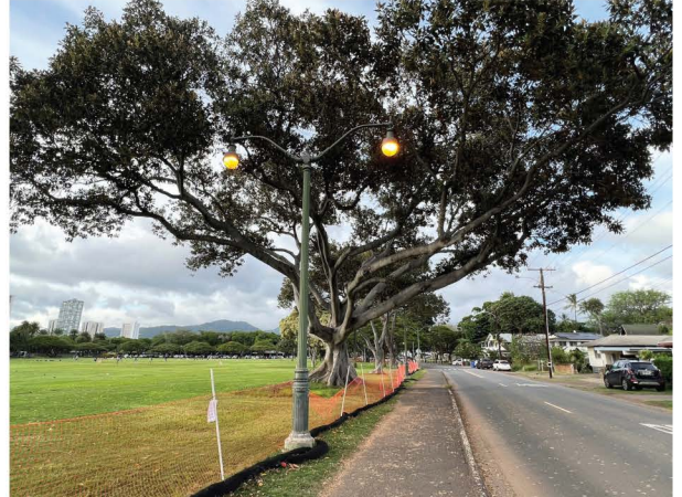
Work on the Kapi'olani Park pathway will begin at Monsarrat Avenue & will progress towards Diamond Head

DPR has announced plans to make improvements to the Kapi'olani Park pedestrian pathway stretching from the Makai-side of Pākī Avenue between Monsarrat Avenue & Poni Moi Road. The project aims to enhance the safety & accessibility of the park's pathways, making it easier for park users to enjoy the park.