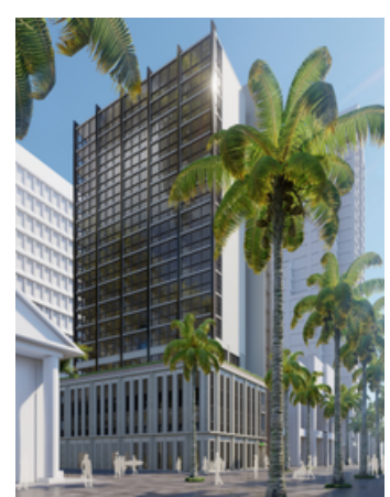
A rendering of the proposed Fort St Mall Senior Housing Project

The City Council approved several affordable housing project proposals recently: