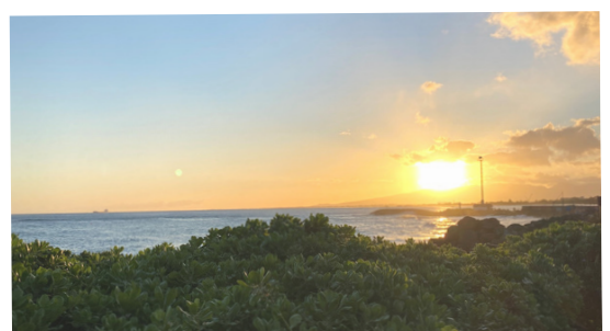
Sunset from the Kakaʻako Waterfront Park

Because of the increase in commercial activities in City parks such as weddings, kayak/canoe rentals and tours, etc., the City's Dept. of Parks & Recreation (DPR) will be introducing a bill in March to attempt to better regulate commercial activities in parks island-wide, rather than on a park-by-park basis. They are welcoming feedback from the public, especially those who use popular parks where this commercial activity frequently occurs. You can provide your comments to DPR via their website at www.honolulu.gov/parks, and my office welcomes your feedback on this as well.