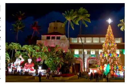
Celebration. The festival was started under Mayor Frank Fasi in the 1980s.

Join the City and County of Honolulu, on Saturday, December 2, 2023 at 4 p.m. on Punchbowl Street and across the Frank F. Fasi Civic Grounds, featuring food vendors and live entertainment. At 6 p.m. the Public Workers' Electric Light Parade will start from A'ala Park and the Mayor's Tree Lighting Ceremony will begin at the front of Honolulu Hale. After the tree lighting ceremony, the City Department Exhibit and the Holiday Wreath Contest Exhibit at Honolulu Hale will officially open to the public. The dazzling Christmas Lights Celebration will illuminate the spirit of the season! Bring your family and friends to witness the grand illumination ceremony with twinkling lights and enchanting decorations. This event is a joyful celebration for all ages. Mark your calendars and join us as we kick off the holiday Above: A previous Honolulu City season in spectacular style!