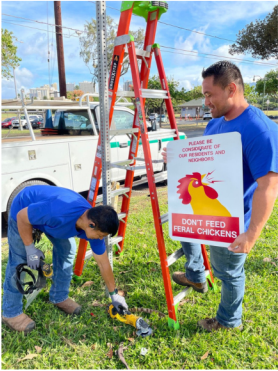
Feral Chickens 3