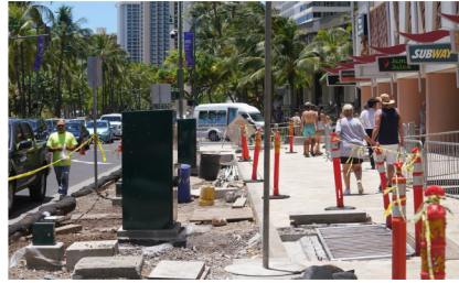
Encampments 2 Sidewalks 4