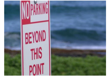
Parking Signs 1