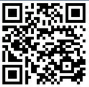
HNL Docs Council Bill Search