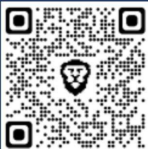
Climate Ready Feedback